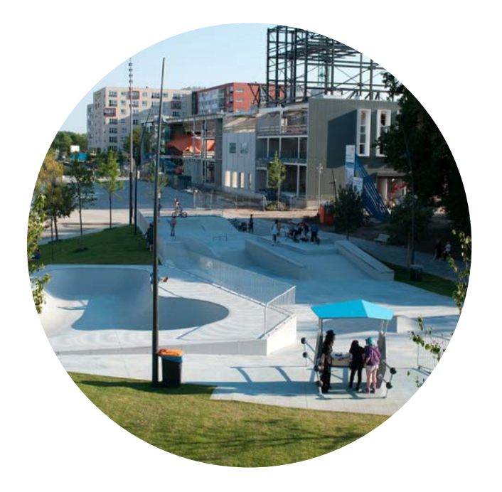
Reference location: Yalp Fono at skatepark in Emmen, The Netherlands

The Yalp Fono allows teenagers to play, mix, and share the music on their mobile phones. In the end, however, it is much more than just a DJ-table. It is an overall meet and hangout spot for teenagers.